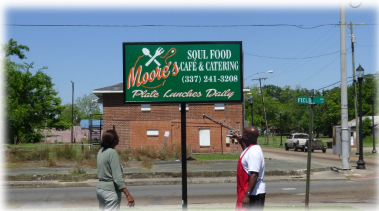
Moore's II Soul Food Café & Catering