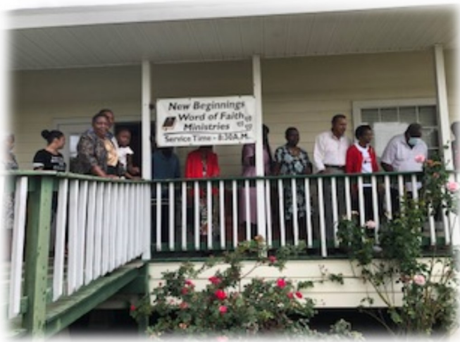
New Beginnings Word of Faith Ministries