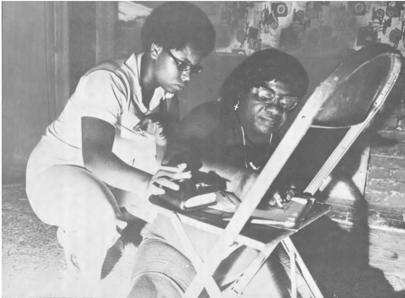
SOUTHERN MUTUAL HELP ASSOCIATION, Inc. Invests in communities, businesses and families